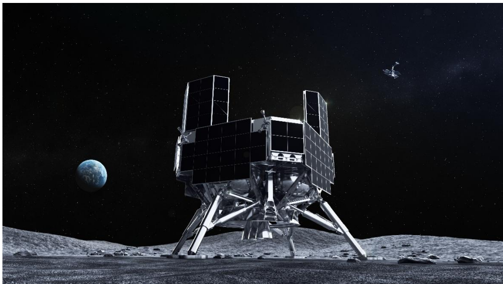
ispace ULTRA Lunar Lander